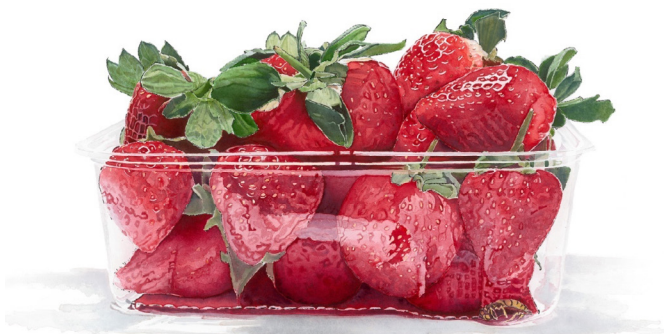
Image: Lucy Clayton Punnet of Strawberries Ink and Watercolour 52x69cm

You can also view the beautiful work of Lucy Clayton which shows sensitivity to line and colour. Her subject matter is inspired by her fascination with marine life and visits to the sea. Often her images are linked to food as she is interested in how these senses can transport you back to a moment in time. One watercolour in the exhibition features a beautifully observed wasp as it feasts in a punnet of delicious strawberries.