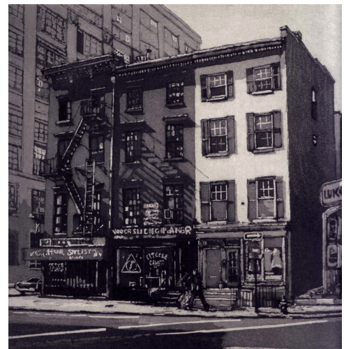
Image: Austin Cole SGFA Nics NY version 2 etching with aquatint 21x21cm

Artist printmaker specialises in the urban landscapes of cities such as London, New York and Tokyo as well as the landscapes of his native Pembrokeshire. Cole transforms his drawing and photographs into etchings using hard grounds and aquatint used by such artists as Rembrandt and Goya, Lucian Freud and Norman Ackroyd.